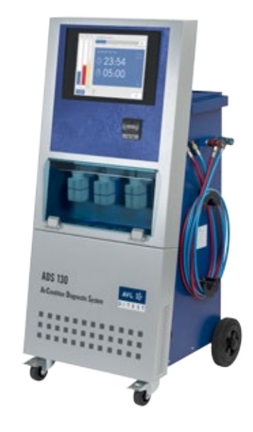
ADS 130: convenient operation thanks to the large touchscreen display