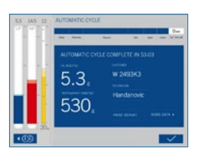
The detailed service report can be printed out and archived as evidence.