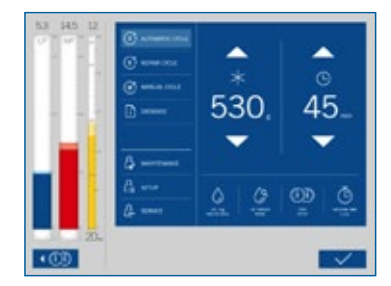
All information at the glance.

See for yourself how quick and easy air conditioning service can be: the software guides you from the function selection stage through performance of the task and right up to the results report. The 15-inch touchscreen display is intuitive and convenient to use.