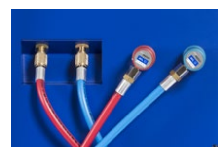
Eco Protect prevents coolant loss