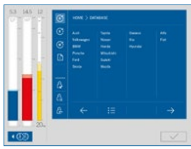
Vehicle database for fully automatic functioning