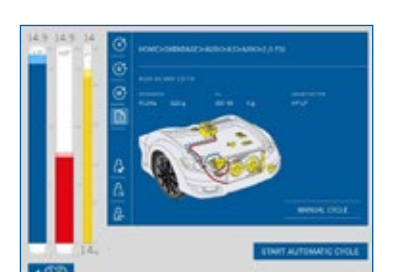
Graphical representations facilitate the act of locating the service coupler and A/C components.